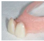
Day of surgery